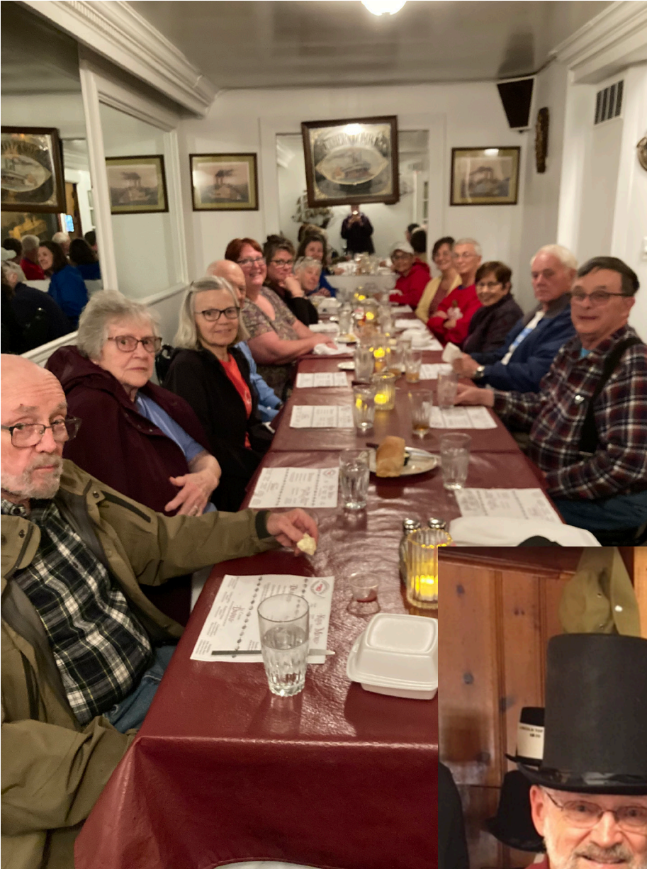
Eating out at the Chesapeake Seafood Restaurant.