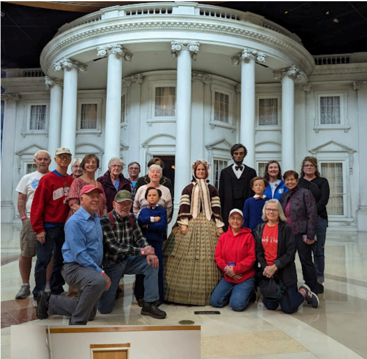
Posing with the Lincoln family at the Lincoln Museum.